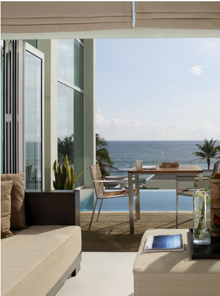
Thai resort, Phuket

Examples from the full visual branding and design program containing all needed branding instruments from logo and in-room artifacts to ad/brochure modules and web/mobile sites.